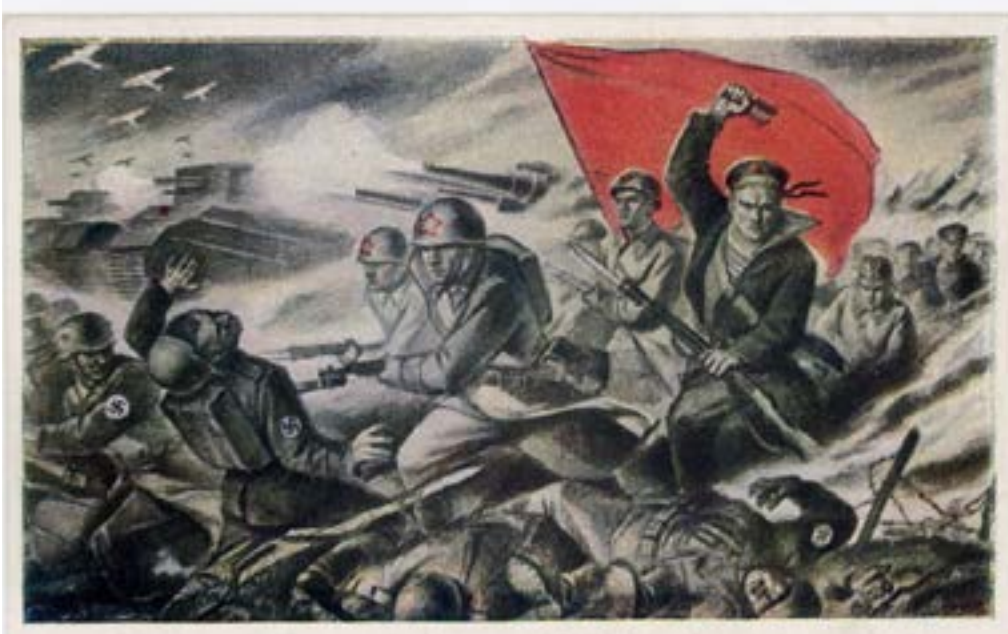
LEN.00637: "Forward until the total annihilation of the enemy!" Postcard published in Leningrad during World War II (19

and digitized more than 11,700 ephemera artifacts, including photographs, documents, letters, and diary pages. The veterans, eager to share "that which can never be forgotten," told us about their enlistment and first experience of battle, relationships with their comrades, battle losses and successes, idealism and disillusionment, and the unique challenges facing Jewish soldiers. Today, the Archive's Veteran Testimonies & Ephemera project is the largest collection of materials dealing with the experience of Jewish soldiers in the Soviet armed forces during World War II. On November 14 and 15, 2021, the Blavatnik Archive will be hosting a virtual conference titled "Jewish Soldiers and Fighters in World War II," with presentations and discussions by nearly forty leading experts from universities, archives, libraries, and museums around the world. Information and registration are available at JewishSoldiersInWWII.org .