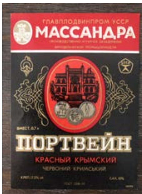
“Label for Soviet-era Crimean fortified wine.”