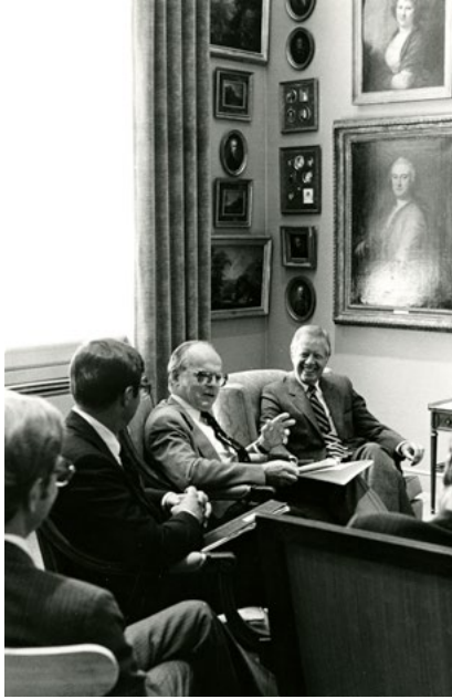
Former President Carter in the Nicolas de Basily Room, Hoover Tower, 1983

Today the collections of the Library & Archives continue to grow under the stewardship of scholar-curators who supervise holdings that include 750,000 volumes in over 70 languages, almost 7,000 archival collections, and hundreds of art objects and artifacts.