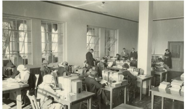
Hoover War Library Reading Room, 1922