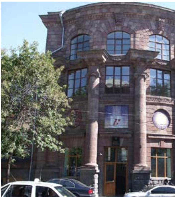
National Library of Armenia